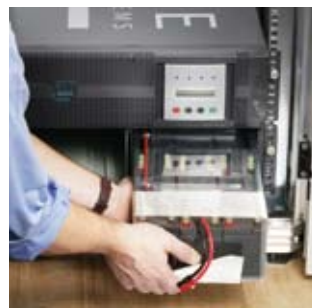
Clear coat battery packaging with thru holes for diagnostic and testing