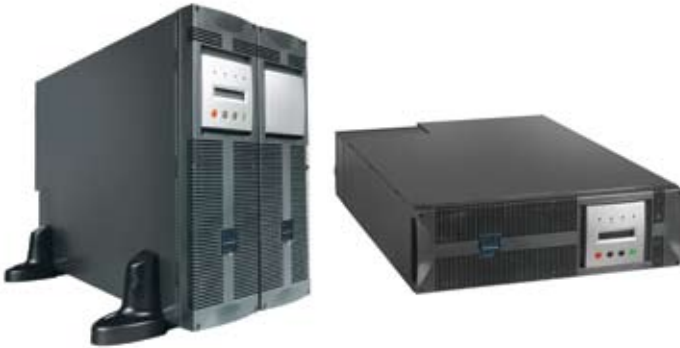
Versatile form factor

The Eaton® EX RT UPS is a UPS designed for sensitive high-density server environments and harsh industrial applications. Specifically engineered to meet demanding customer applications in IT systems, measuring instruments, PLCs and industrial PC markets, the EX RT is fully compatible with genset redundancy requirements in most instances. The manual bypass, hot-swap I/O box and intuitive LCD control panel are just a few of the many differentiating features that make the EX RT the ideal product for the 5–11 kVA power range.