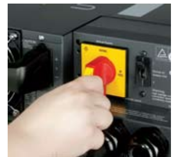
Hot-swappable I/O Box