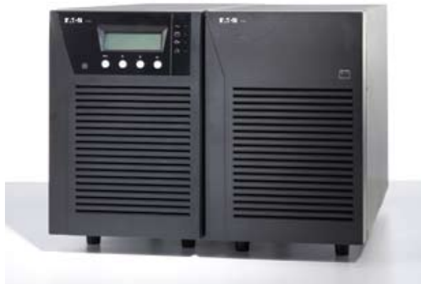
Add up to four EBMs for hours of runtime