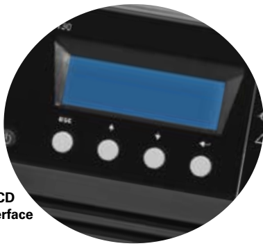
Bright LCD user interface