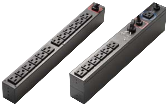
Optional FlexPDU and HotSwap MBP for greater flexibility and uptime

Eaton NetWatch Client 5.0 has tested compatible with Cisco Unified Communications Manager 4.3. Go to www.eaton.com/PQ/cisco for disclaimer.